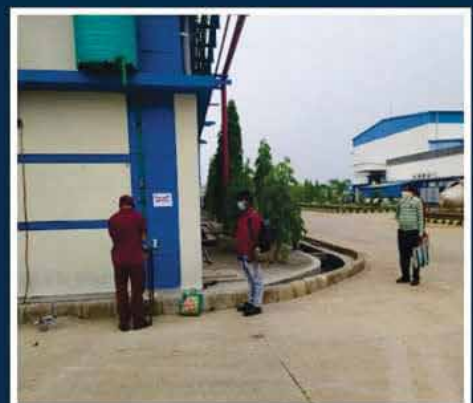
Safety measures being taken at Supreme Plant for COVID 19 pandemic