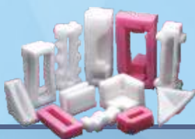
Protective Packaging Products