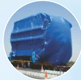
Multilayered Cross Laminated Films