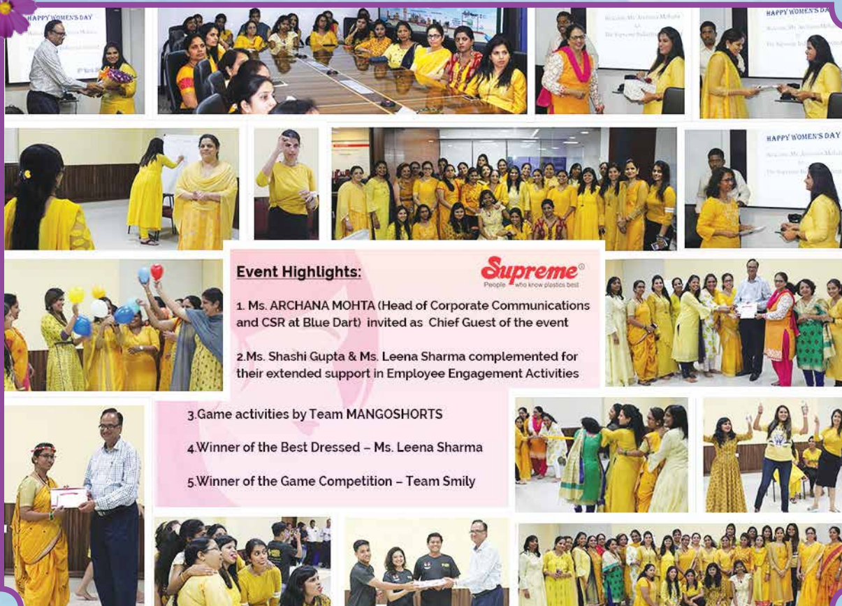
Women's Day Celebration