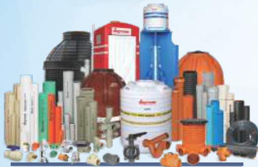
Plastic Piping Systems