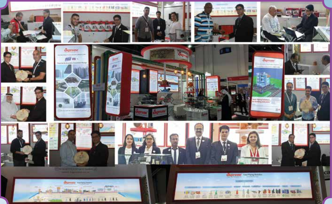
Complementing deca-millionaire trade partners and capturing the business moments at BIG 5'19 exhibition held at DWTC, Dubai, United Arab Emirates.