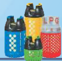
Composite LPG Cylinders