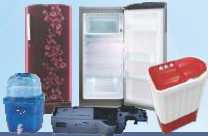
Industrial Moulded Products

UNMATCHED ARRAY OF ADVANCED CUSTOMIZED PRODUCTS & SOLUTIONS