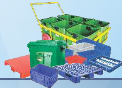
Material Handling Products